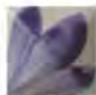
OS173 (C) SUMMER BLUE