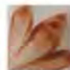
OS197 (C) SIENNA BROWN