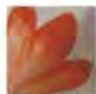
OS029 (C) DEEP MANDARIN