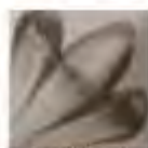
OS209 (C) GREY