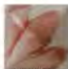
OS041 (B) CORAL PINK