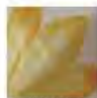
OS017 (B) DAFFODIL