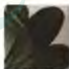
OS157 (C) BRUNSWICK GREEN