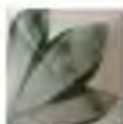
OS149 (B) EMERALD GREEN