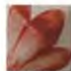
OS061 (B) ROYAL RED