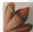
OS201 (C) GOLD BROWN