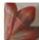
OS053 (B) ROMANCE RED