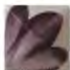
OS117 (A) ROYAL PURPLE