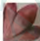
OS105 (A) BURGUNDY