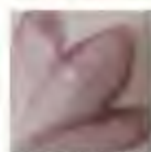
OS097 (A) MAUVE