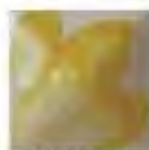
OS013 (B) CITRUS