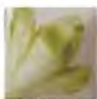
OS121 (B) LIME