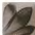
OS213 (C) ART GREY