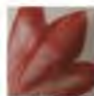
OS069 (C) PRISM RED