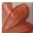
OS037 (C) PERSIMMON