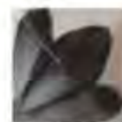
OS193 (C) TEAL