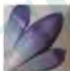
OS177 (C) SAPPHIRE BLUE