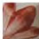
OS045 (A) CORAL RED