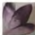
OS101 (A) LAVENDER