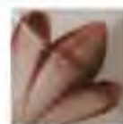
OS077 (A) CORAL