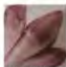
OS093 (A) ORCHID