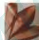
OS081 (A) TERRACOTTA