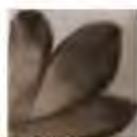
OS204 (A) ANTIQUÉ BROWN