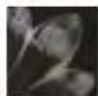
OS001 (C) WHITE