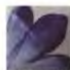
OS169 (C) WEDGEWOOD BLUE