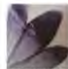
OS113 (A) PURPLE