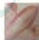
OS085 (A) ROSE PINK