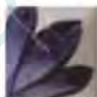
OS181 (C) BRIGHT BLUE