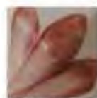
OS065 (B) BRICK RED