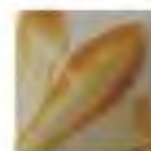
OS021 (B) GOLDEN YELLOW