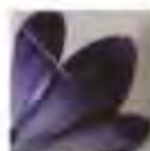
OS185 (C) PRISM BLUE