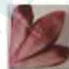
OS109 (A) CRIMSON