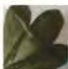
OS125 (C) LEAF GREEN