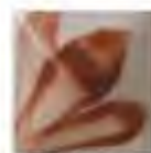
OS073 (B) APRICOT PRESERVE