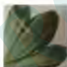
OS153 (C) GRASS GREEN