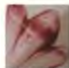
OS089 (A) DUSKY PINK