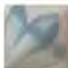
OS161 (C) BABY BLUE