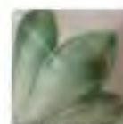
OS137 (B) JASPER