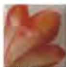
OS033 (C) DEEP ORANGE