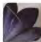
OS189 (C) COBALT BLUE