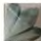
OS141 (C) JADE GREEN