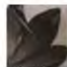
OS216 (C) COBALT BLACK