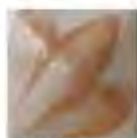
OS005 (B) PASTEL SALMON