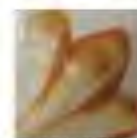
OS025 (B) BURNT ORANGE