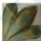
OS129 (B) OLIVE GREEN