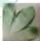
OS133 (B) PARIS GREEN