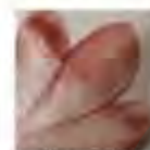
OS049 (A) RUBY RED