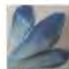
OS165 (C) TURQUOISE