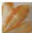
OS009 (B) SHEER PEACH