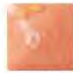
FG037 VERMILLION SUNBURST