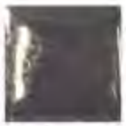
FS201 ™ BRONZE METAL