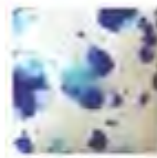
FG006 BLUE EYES