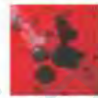
FG084 LADY BIRD