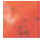
FG039 AYERS ROCK