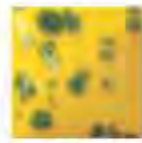
FG034 BUMBLE BEE