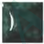
FS145 ™ SHEN DAN LU