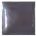
FS205 ™ GUN METAL