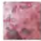
FG055 FAIRY FLOSS