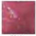
FG121 WINE FIESTA