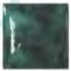
FS157 ™ FEICUI LU