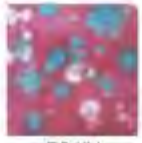
FG124 BERRY GOOD