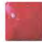
FG081 FUCHSIA FANTASTIC