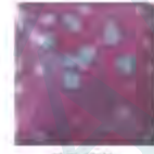
FG175 ROYAL AMETHYST