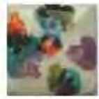
FG009 BUBBLE GUM