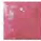
FG057 ORIENTAL PRINCESS